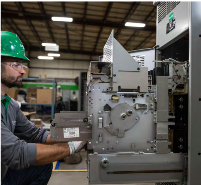
Equipment is de-energized