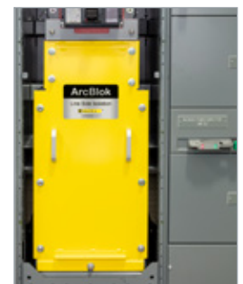
Cable vault is designed to isolate arcs on the line side conductors