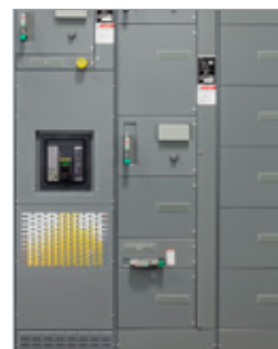
ArcBlok MCC Arc Flash Event: 100kA @ 480V